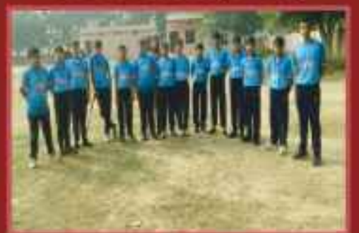
Cricket Team at Zonal level