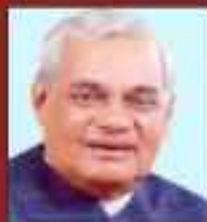
Atal Bihari Vajpayee DAV Kanpur