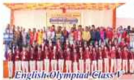
English Olympiad Class V