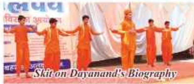
Skit on Dayanand's Biography