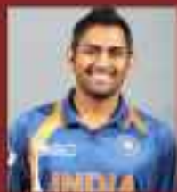
Mahendra Singh Dhoni DAV Ranchi