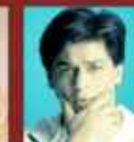
Shahrukh Khan Hansraj College Delhi