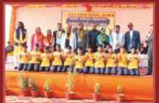
Kabaddi team winner at state level (U-14)