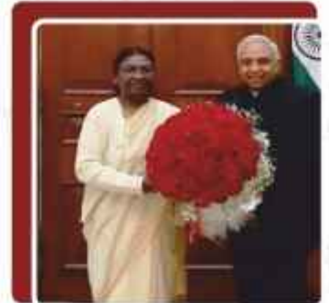
Meeting With President of India

DAV has been making a significant contribution to the society through spreading value-based education keeping the ancient Vedic heritage in mind. In fact, it is the only organization which has set high standards in education while maintaining a balance between Vedic wisdom and modernity.