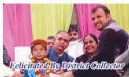
Felicitated By District Collector