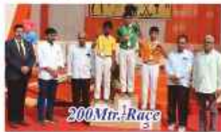
200 Mtr. Race