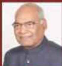
Ramnath Kovind DAV College Kanpur