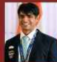
Neeraj Chopra DAV College Chandigarh