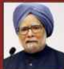
Manmohan Singh DAV Chakwal Pakistan