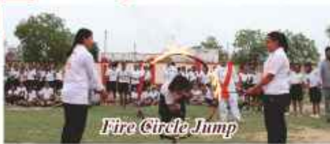
Fire Circle Jump