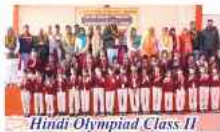
Hindi Olympiad Class II