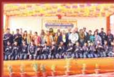
Winners at State level