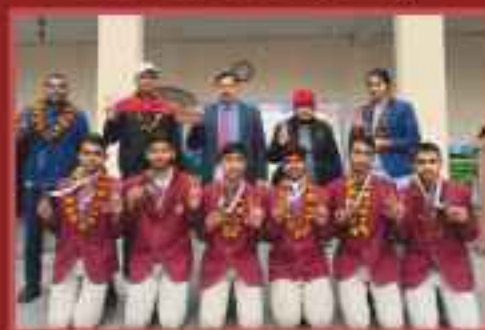
Marathon Organised by AU In Jaipur