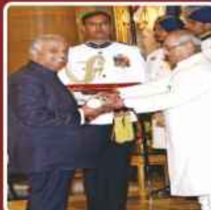
Honoured with Padma Shri For Literature & Education Field