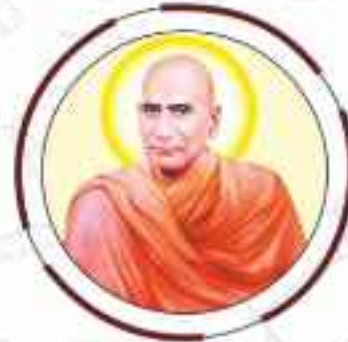
Swami Shradhdhanand ji