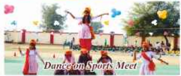
Dance on Sports Meet