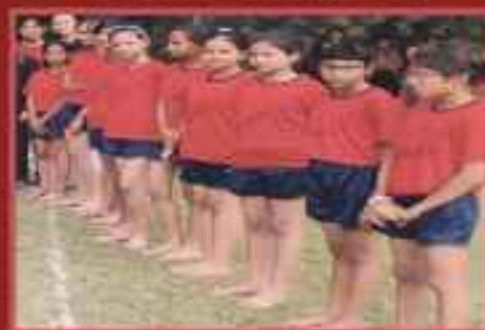
Kho-Kho winner at zonal level