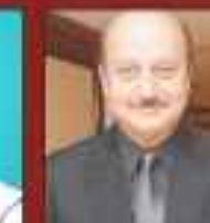
Anupam Kher DAV Shimla