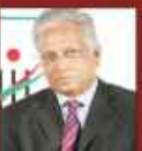
Mohinder Amarnath DAV Amritsar