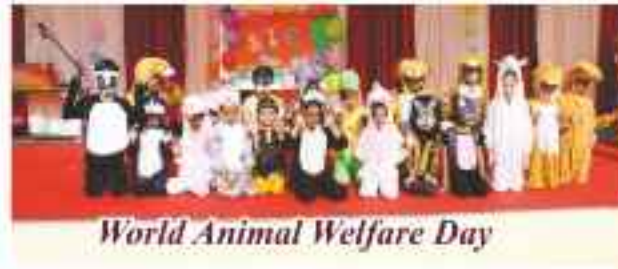
World Animal Welfare Day