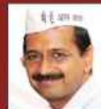
Arvind Kejriwal DAV Hisar