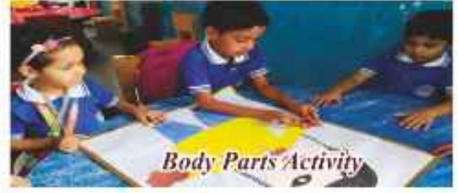
Body Parts Activity