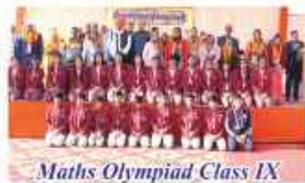
Maths Olympiad Class IX