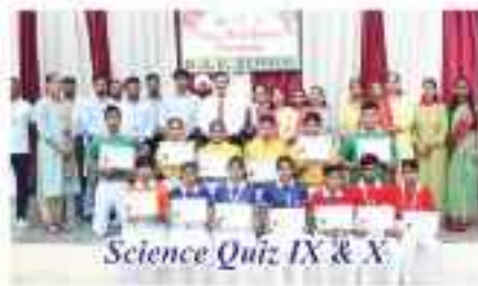
Science Quiz IX & X