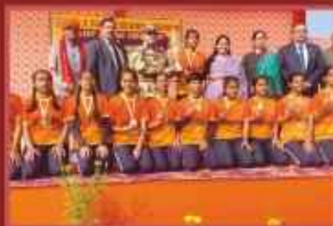
2nd Runner up Kabaddi Team at National Level