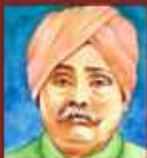
Lala Lajpat Rai DAV Lahore