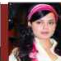
Kangana Ranaut Hansraj College Chandigarh