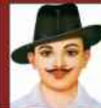
Bhagat Singh DAV College Lahore