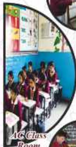
AC Class Room