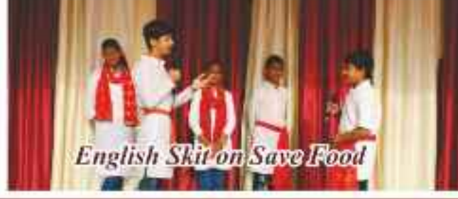
English Skit on Save Food