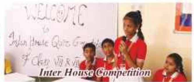
Inter House Competition