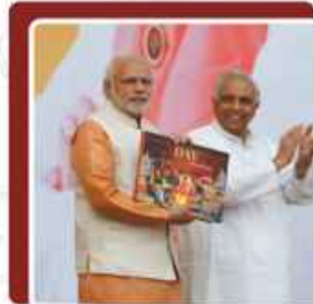
D.A.V. United Festival in Delhi