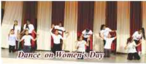
Dance on Women's Day