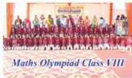
Maths Olympiad Class VIII