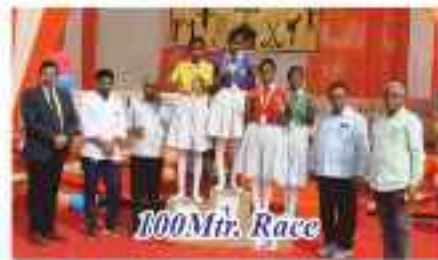
100 Mtr. Race