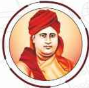
Mahrishi Dayanand Saraswati

It is the matter of great pride for all of us that D.A.V. organization has completed its 138 years with tremendous success. Mahatma Hansraj was the founder Principal of the first D.A.V. School and he gave his service for 25 years for D.A.V. organization on honorary basis. Now D.A.V. organization is running more than 1056 schools and colleges all over India and abroad also. Most of D.A.V. School are affiliated to CBSE board and maintain the best quality Education thus giving responsibility and plays and renowned role to the society. Towards the end of the 19th century India plays a renowned role in a social political framework. This led Maharishi Dayanand to form the Arya Samaj reform of the Indian Society Intellectually, emotionally and spiritually with a call "Back to Vedas", he gave the guidance through the principles of the Arya Samaj, in which the foremost was necessary of education.