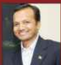
Naveen Jindal Hansraj College Delhi