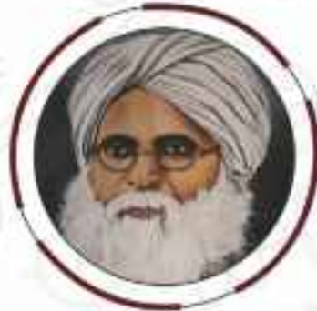
Mahatma Hansraj ji