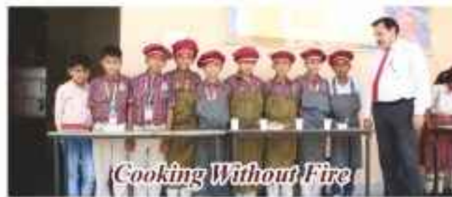
Cooking Without Fire