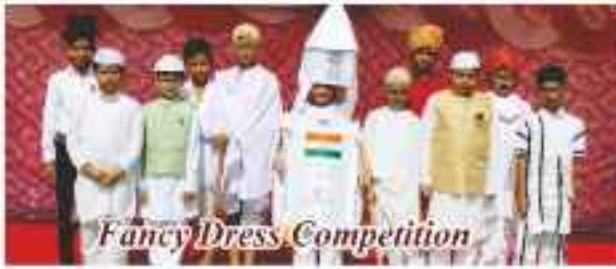
Fancy Dress Competition