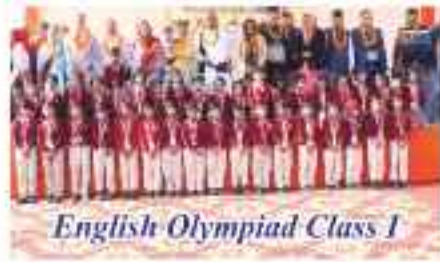
English Olympiad Class I