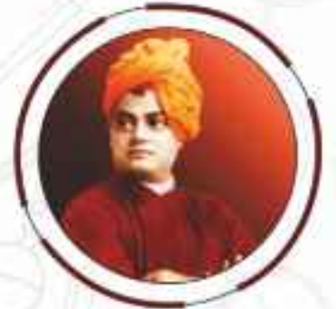
Swami Vivekanand ji