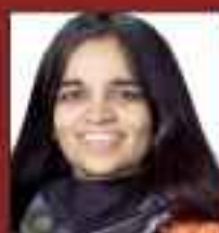
Kalpana Chawla DAV Kamal