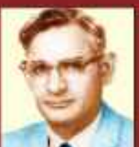
Hargobind Khorana DAV High School Multan