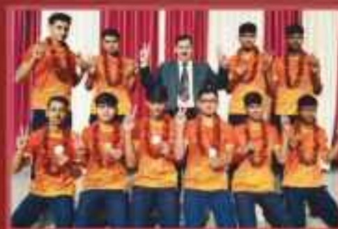
Kabaddi team winner at state level (U-19)