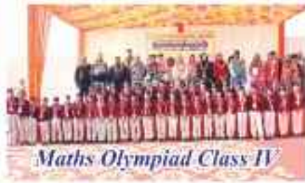
Maths Olympiad Class IV