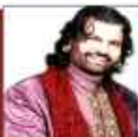
Hansraj Hans DAV College Jalandhar