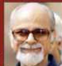
Inder Kumar Gujral DAV College Lahore