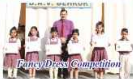
Fancy Dress Competition