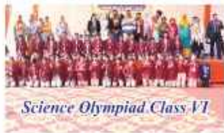
Science Olympiad Class VI