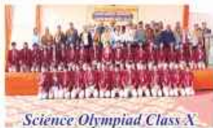
Science Olympiad Class X