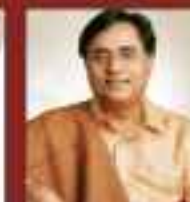
Jagjit Singh DAV College Jalandhar