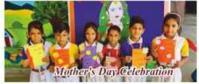
Mother's Day Celebration