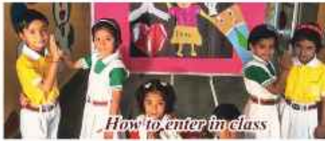
How to enter in class