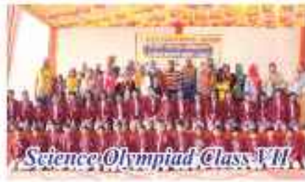
Science Olympiad Class VII