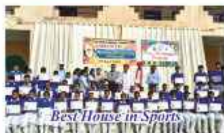
Best House in Sports