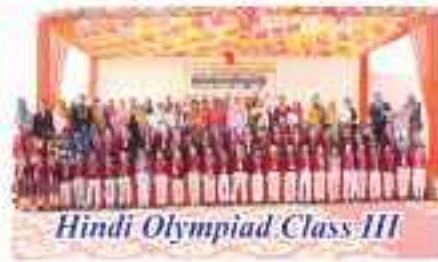
Hindi Olympiad Class III