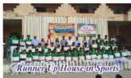
Runner Up House in Sports