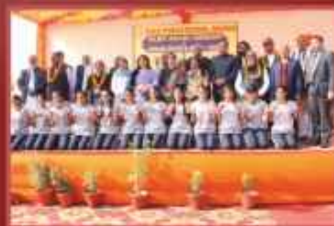
Kabaddi team winner at state level (U-19)