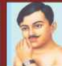
Chandra Shekhar Azad DAV College Lahore