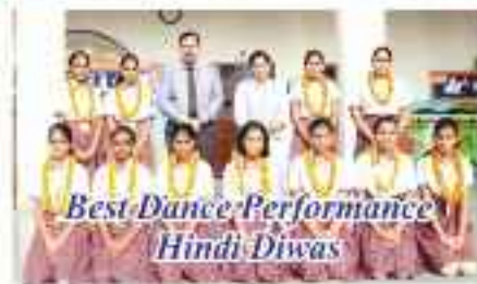
Best Dance Performance Hindi Diwas